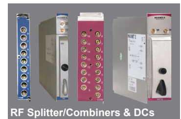
RF Splitter/Combiners & DCs