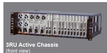
3RU Active Chassis (front view)